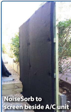
NoiseSorb to screen beside A/C unit